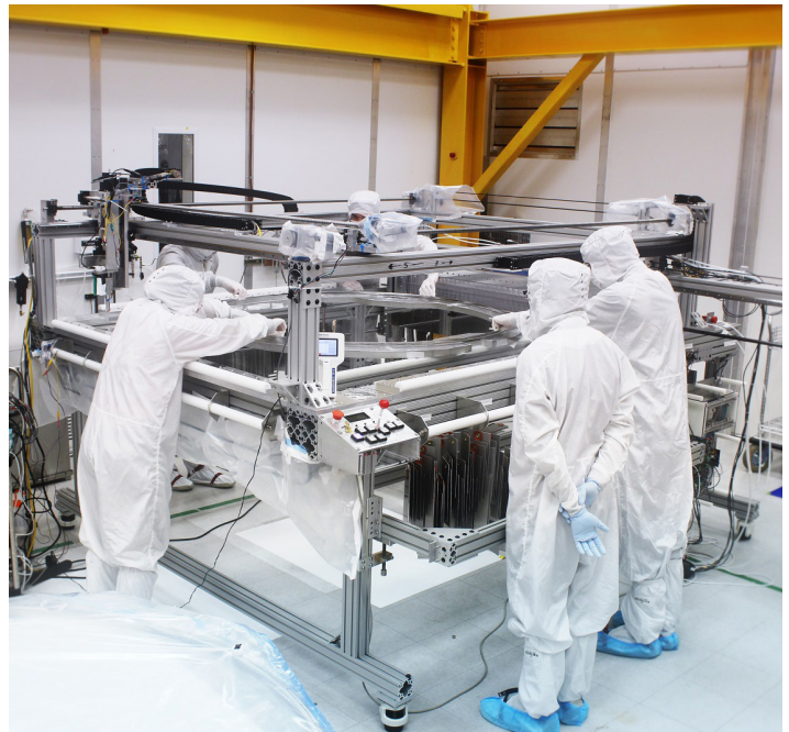
Members of SLAC's LZ team with the loom they used to weave high-voltage grids for the next-gen dark matter experiment.