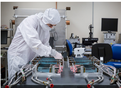
Top: the ATLAS detector at CERN's Large Hadron Collider records the debris produced when powerful proton beams collide. This is how scientists study the properties of fundamental particles and forces and try to find new ones.

In addition to building detector components and developing sophisticated data analysis algorithms for ATLAS, SLAC is leading accelerator R&D for the next step beyond the LHC, which is critical to enabling precision measurements of the Higgs boson and high energy searches for new particles.