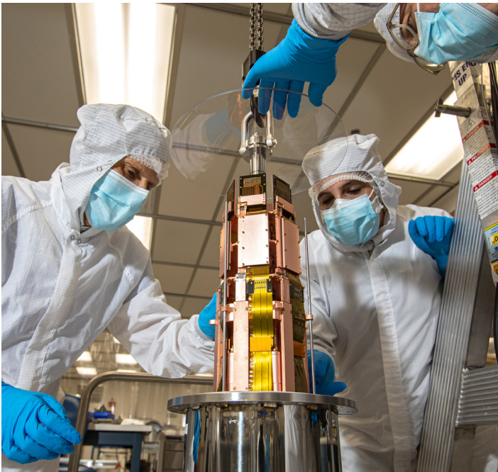
Researchers examine one of four SuperCDMS detector towers, which were built at SLAC.